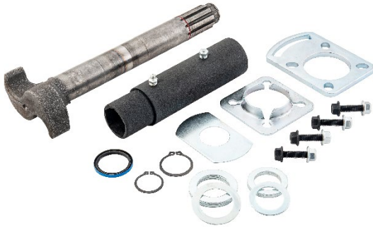
C0111A-L Extreme S-Cam Bushing Kit (11-1/32" S-Cam, 1-7/8" Bore, Left-Hand)