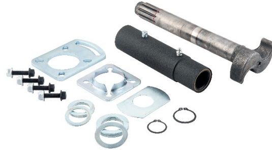
C0211A-R Extreme S-Cam Bushing Kit (11-1/32" S-Cam, 2" Bore, Right-Hand)