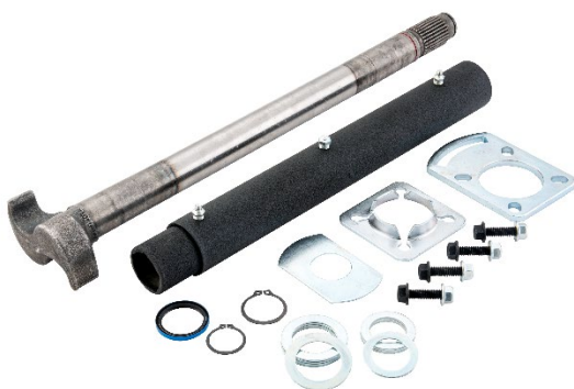
C1122A-L Extreme S-Cam Bushing Kit (22-3/8" S-Cam, 1-7/8" Bore, Left-Hand)