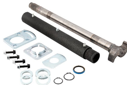
C1124A-R Extreme S-Cam Bushing Kit (24-3/8" S-Cam, 1-7/8" Bore, Right-Hand)