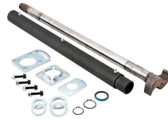
C1130A-R Extreme S-Cam Bushing Kit (30-1/4" S-Cam, 1-7/8" Bore, Right-Hand)