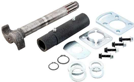
C0211A-L Extreme S-Cam Bushing Kit (11-1/32" S-Cam, 2" Bore, Left-Hand)

Extreme Cam left-hand and right-hand (-L and -R) kits include the s-cam, enclosed cam tube with built-in bushing, seals, and grease fittings, mounting bracket set, and washer/spacer set.