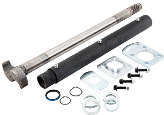
C1124A-L Extreme S-Cam Bushing Kit (24-3/8" S-Cam, 1-7/8" Bore, Left-Hand)