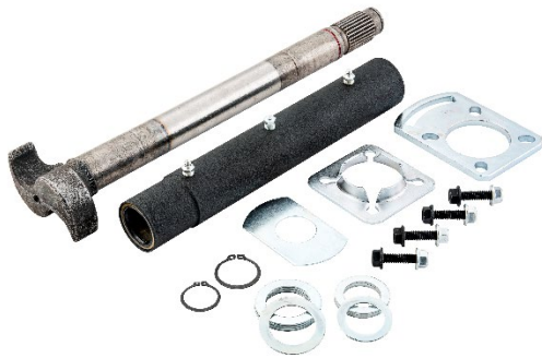
C1218A-L Extreme S-Cam Bushing Kit (18-5/8" S-Cam, 2" Bore, Left-Hand)

Extreme Cam left-hand and right-hand (-L and -R) kits include the s-cam, enclosed cam tube with built-in bushing, seals, and grease fittings, mounting bracket set, and washer/spacer set.