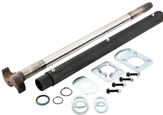
C1130A-L Extreme S-Cam Bushing Kit (30-1/4" S-Cam, 1-7/8" Bore, Left-Hand)