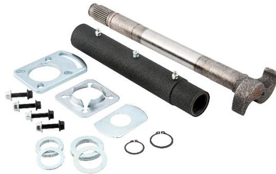
C1218A-R Extreme S-Cam Bushing Kit (18-5/8" S-Cam, 2" Bore, Right-Hand)