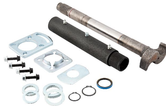
C1116A-R Extreme S-Cam Bushing Kit (16-5/16" S-Cam, 1-7/8" Bore, Right-Hand)