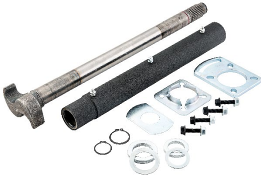
C1222A-L Extreme S-Cam Bushing Kit (22-3/8" S-Cam, 2" Bore, Left-Hand)

Extreme Cam left-hand and right-hand (-L and -R) kits include the s-cam, enclosed cam tube with built-in bushing, seals, and grease fittings, mounting bracket set, and washer/spacer set.