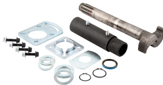
C0111A-R Extreme S-Cam Bushing Kit (11-1/32" S-Cam, 1-7/8" Bore, Right-Hand)