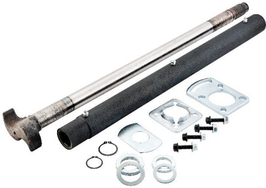
C1230A-L Extreme S-Cam Bushing Kit (30-1/4" S-Cam, 2" Bore, Left-Hand)

Extreme Cam left-hand and right-hand (-L and -R) kits include the s-cam, enclosed cam tube with built-in bushing, seals, and grease fittings, mounting bracket set, and washer/spacer set.