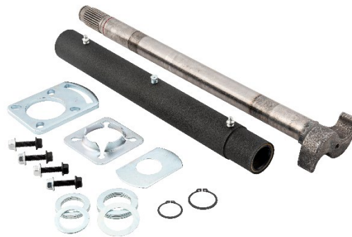
C1222A-R Extreme S-Cam Bushing Kit (22-3/8" S-Cam, 2" Bore, Right-Hand)