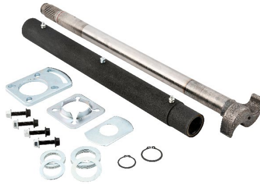
C1226A-R Extreme S-Cam Bushing Kit (26-1/2" S-Cam, 2" Bore, Right-Hand)