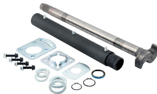
C1122A-R Extreme S-Cam Bushing Kit (22-3/8" S-Cam, 1-7/8" Bore, Right-Hand)