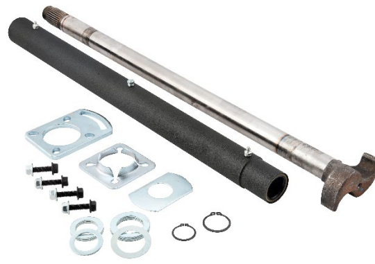
C1230A-R Extreme S-Cam Bushing Kit (30-1/4" S-Cam, 2" Bore, Right-Hand)