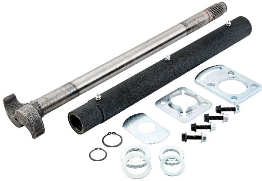
C1226A-L Extreme S-Cam Bushing Kit (26-1/2" S-Cam, 2" Bore, Left-Hand)

Extreme Cam left-hand and right-hand (-L and -R) kits include the s-cam, enclosed cam tube with built-in bushing, seals, and grease fittings, mounting bracket set, and washer/spacer set.