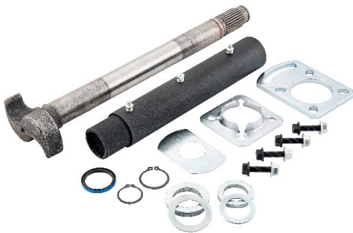
C1118A-L Extreme S-Cam Bushing Kit (18-5/8" S-Cam, 1-7/8" Bore, Left-Hand)