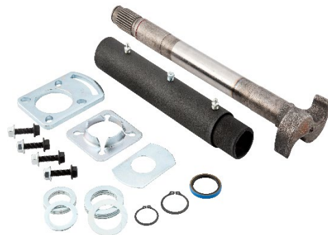
C1118A-R Extreme S-Cam Bushing Kit (18-5/8" S-Cam, 1-7/8" Bore, Right-Hand)