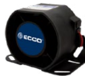
800 Series Back Up Alarm Surface Mount PART# 850N