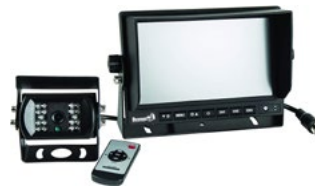
Backup Camera System W/ Night Vision PART# 8883000