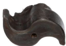
Rotation = CCW