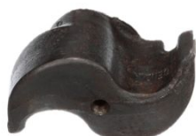
Rotation = CW

Head Style graphics and dimensions are for identification purposes only.