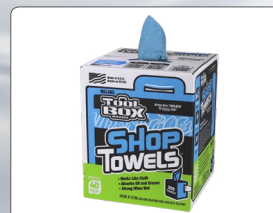
Z400 Box of Center-Pull Shop Towels