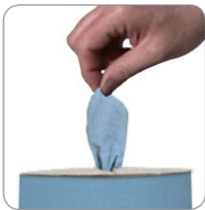
Can be used as a stand alone dispenser