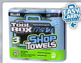
Z400 Roll of Shop Towels 3PK