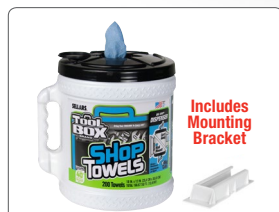
Z400 BIG GRIP® Dispenser of Shop Towels