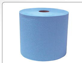
Z400 Jumbo Roll of Shop Towels