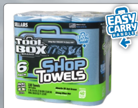
Z400 Roll of Shop Towels 6PK