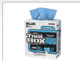
Z400 Interfold Shop Towels