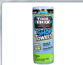
Z400 Roll of Shop Towels

Made With 40% Post-Consumer Recycled Fibers*