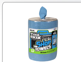
Z400 BIG GRIP® Refill of Shop Towels